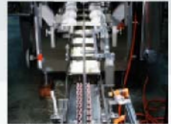
Photo eyes for speed control on the infeed conveyor are used to allow the incoming product supply to smoothly control the machine speed to avoid machine stoppages.