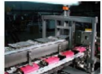
A pneumatic lift-up overhead conveyor on the ADCO WA makes clearing carton jams a simple operation.