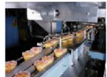
The ADCO WA-series of cartoners can be equipped with custom product infeed/indexers to provide customers the unique carton/product orientation they are looking for.