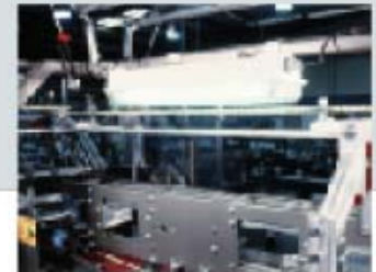
Standard overhead lights help to illuminate the ADCO WA-series of machines to help operators get a better view of how the machine is operating.