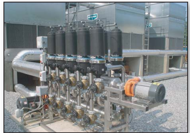
10-Pod, 800 GPM Side-Stream System, complete with Main Pump and Booster Pump