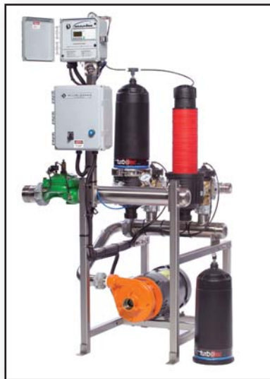
2-Pod Side-Stream System, complete with 150 GPM Pump