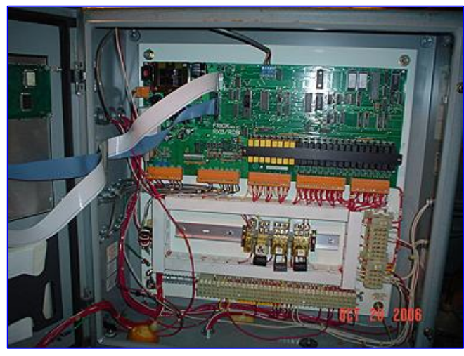
The following pictures show the unit removed and stored at our facility in Edinburg, TX