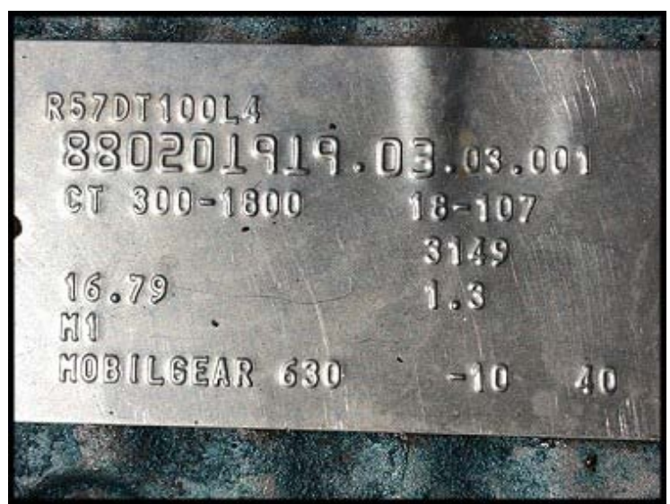
See DO Model info next page.