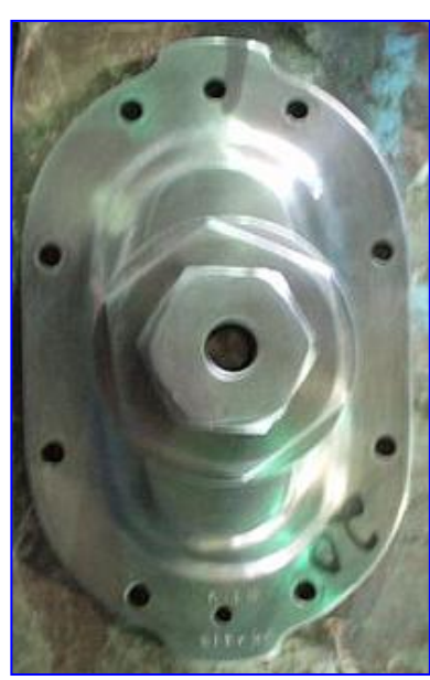
Motor drive is not included, but we can set up this pump with a drive if requested. These are sample pictures.