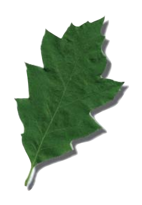
Not Just Clean, It's Green.