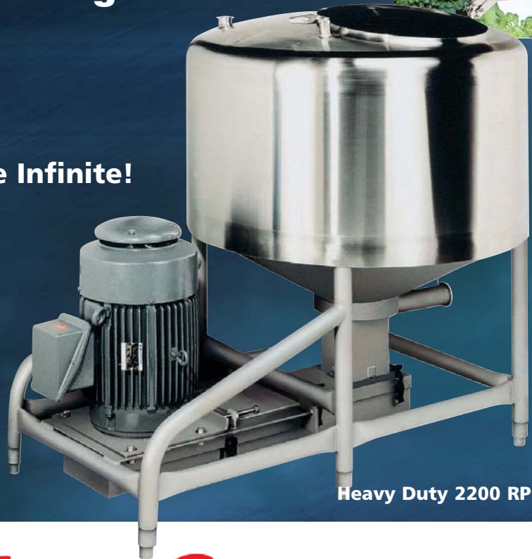
Heavy Duty 2200 RPM LOR