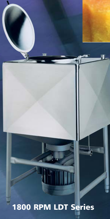
1800 RPM LDT Series