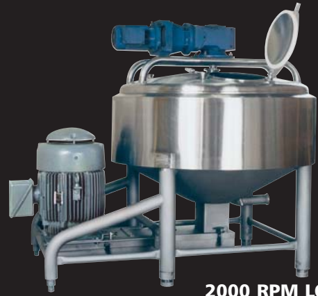
2000 RPM LORSS