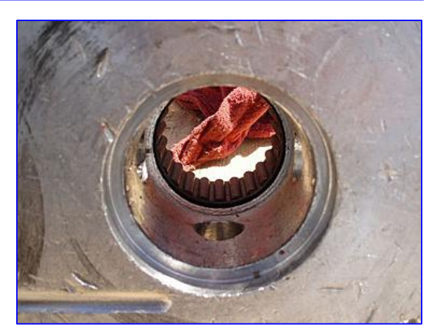
Note: the following picture show the exact unit prior to removal.