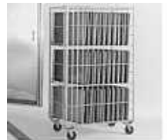
STANDARD & CUSTOM WASH RACKS

The Douglas Model 2554-B is a walk-in type, stainless steel batch washer designed to wash and sanitize single or double oven/cooling racks. It is also a high-volume pot, pan and utensil washer that can quickly and efficiently clean sheet pans, cake pans, muffin pans, baking pans, trays, steam table pans, totes, bins, barrels, buckets and other items commonly found in the the bakery, meat, poultry, candy and foodservice industries. These items are loaded into special roll-in wash racks that are specifically designed to hold them for the most effective cleaning. Recirculating wash water is pumped through high velocity, stainless steel "V" jets designed to cut and remove stubborn soils and baked-on goods. With a high powered 25 H.P. pump, a standard 54 pan or optional 72 pan capacity and a typical wash/rinse cycle of just 5 minutes, clean-up is quick and convenient. Available with electric, infrared gas and steam heating, this large volume washer is ideal for wholesale bakeries, food processing plants, business commissaries, restaurants, hotels and institutions.