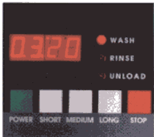
DIGITAL CONTROL & INFORMATION CENTER