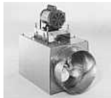
OPTIONAL STEAM EXTRACTION FAN