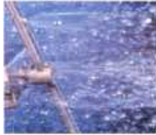
PRECISION ENGINEERED SPRAY ARM ASSEMBLY