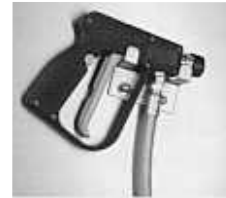
OPTIONAL WASH-DOWN HOSE & SPRAY GUN