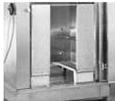
OPTIONAL FOLD-AWAY RAMP SYSTEM