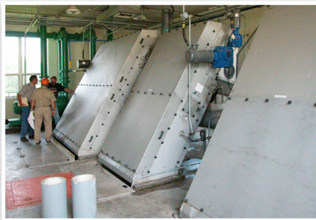
Completely enclosed for odor control and hygienic operation.