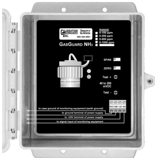
Figure 2: Wiring diagram