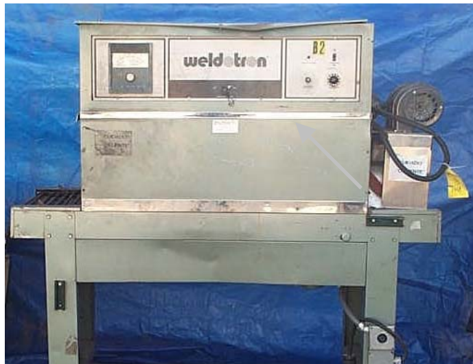
Shrink Tunnel Model 7221 Serial Number TE14972B