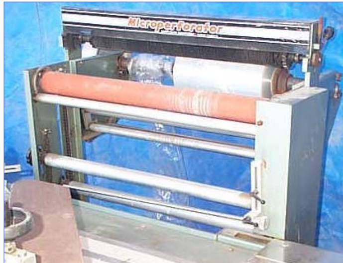
Microperforator Roller 27.5 in W

Weldtron Shrink Wrap sn4097516 stock No. D-073a.22, package 20Wx8Hx42L in,conveyor 19Wx33Lx36H in,tunnel mdl7221 snTE14972B 20Wx8H in,wrapper mdl1715 snUD97516 11Lx6Wx4.5H ft,cutter 15Wx6H in,run speed 460,temp control top-bottom-cross seals, adj heat-vacuum,scrap arbor mdl 269 220V