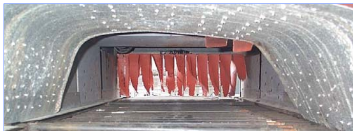
Opening 20 in W x 8 in H